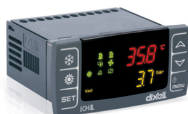
Controller in single circuit CGCM/CXCM units